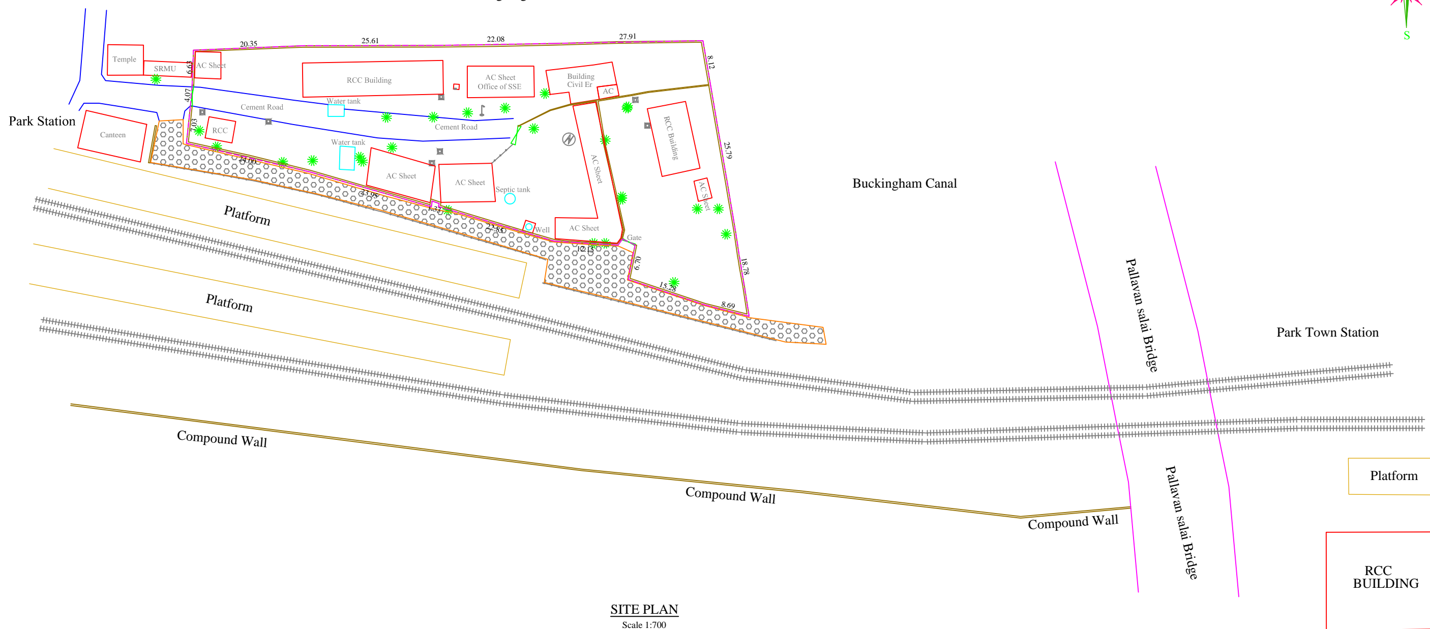
SITE PLAN Scale 1:700

TOTAL PLOT AREA - _____ PROPOSED PLOT AREA - 3305.9289 Sq.m (0.331Ha)