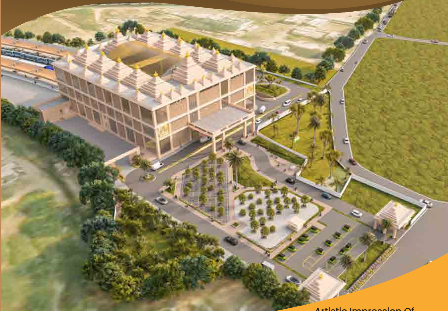
Artistic Impression Of Somnath Railway Station