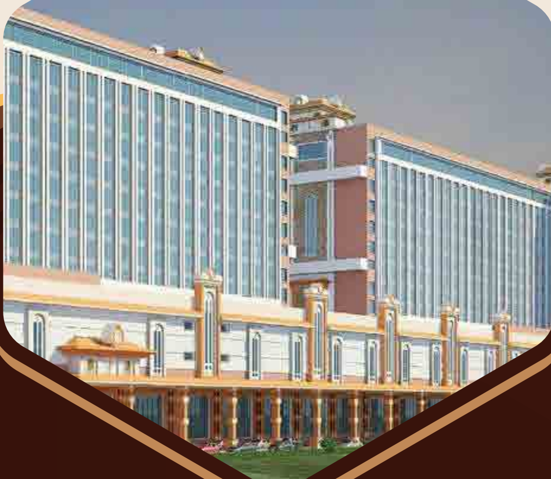
Artistic Impression Of Tirupati Railway Station

A Statutory Authority Under Ministry Of Railways, Government Of India