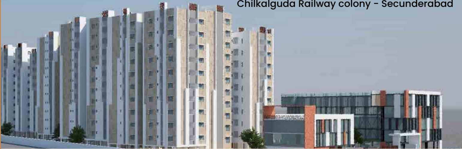
Chilkaalguda Railway colony - Secunderabad

Grant of Lease for Commercial Development of approx. 0.45 Acre of Railway Land near Kendriya Vidyalaya School, Tatichetlapalem, Visakhapatnam of Waltair Division (East Coast Railway) for 45 years Lease Period