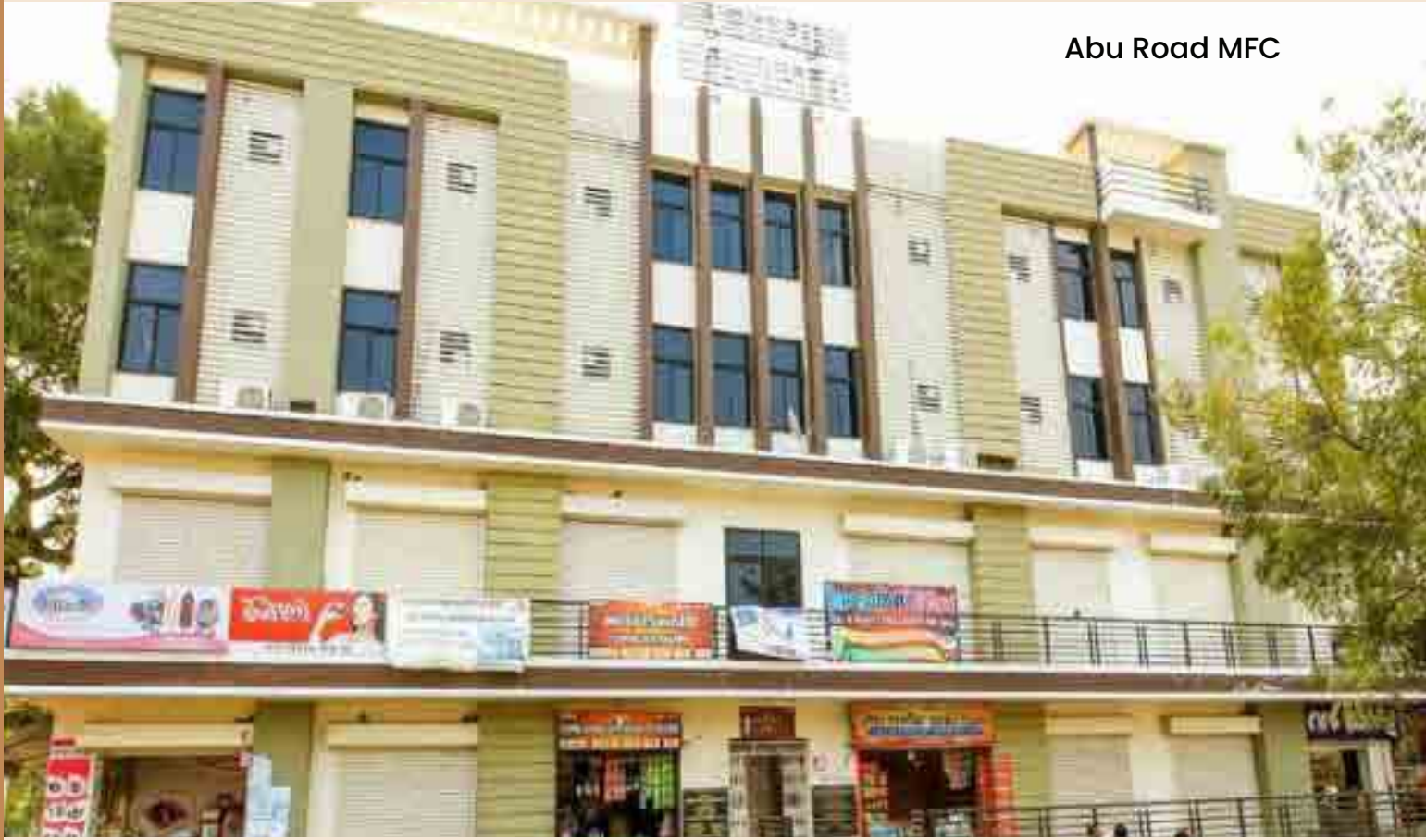
Abu Road MFC