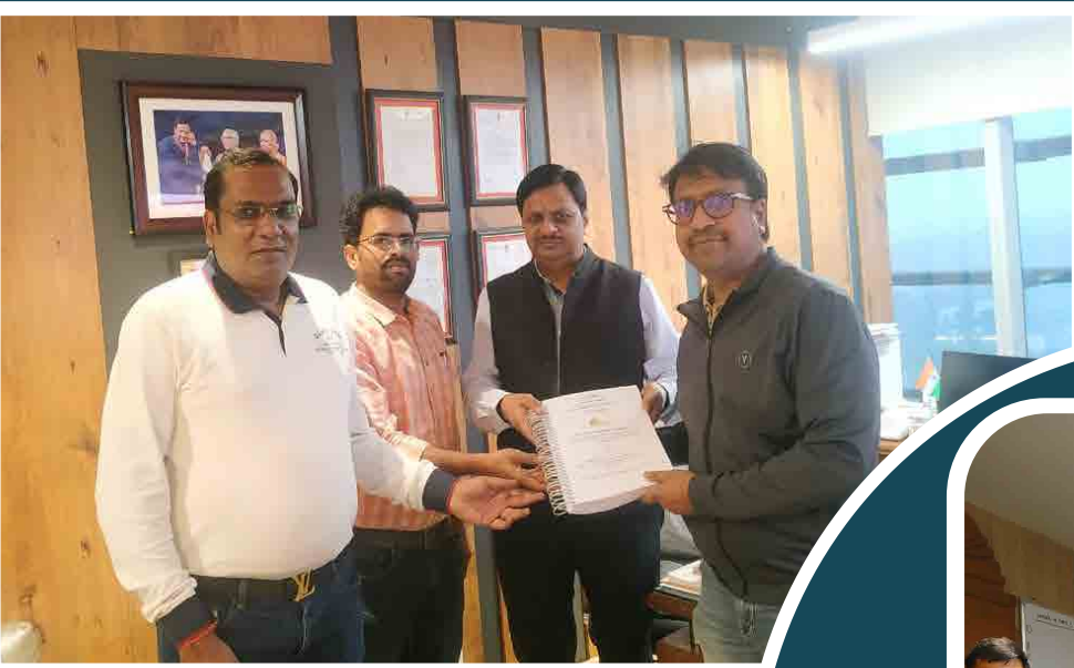
Railway Land at Kannur Railway Colony with Developer on 01/12/2023

Land Leasing Agreement signed during the Quarter: -