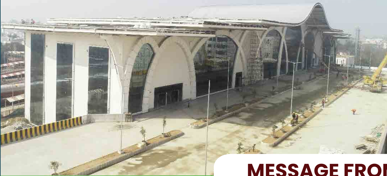
Under Construction Image of Gomti Nagar Station