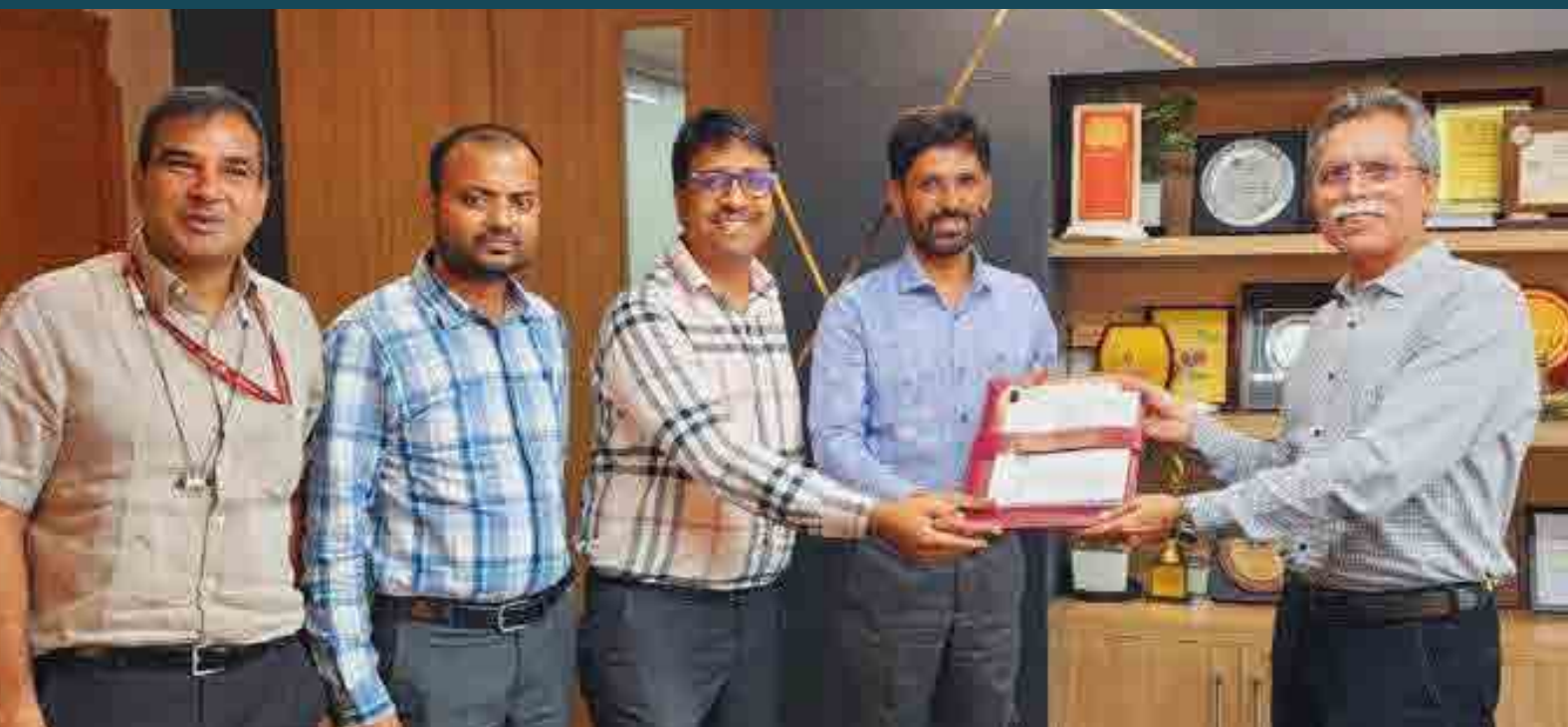
Railway Land Parcel at New Bijwasan Railway Station, Delhi with Developer on 12/10/2023

Land Leasing Agreement signed during the Quarter: -