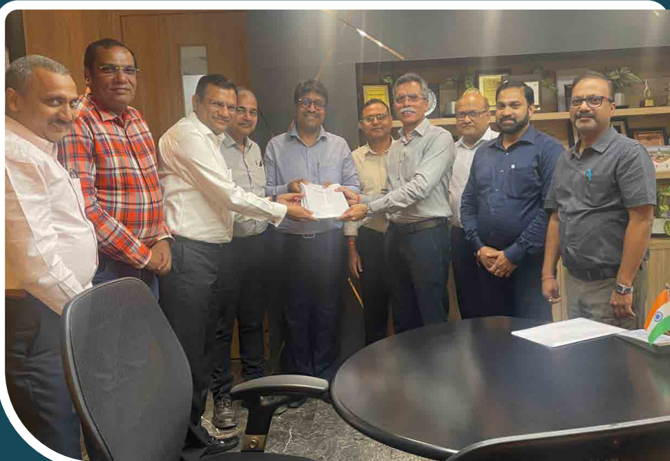
Railway Land at Sirsa under Bikaner Division with Developer on 02/11/2023