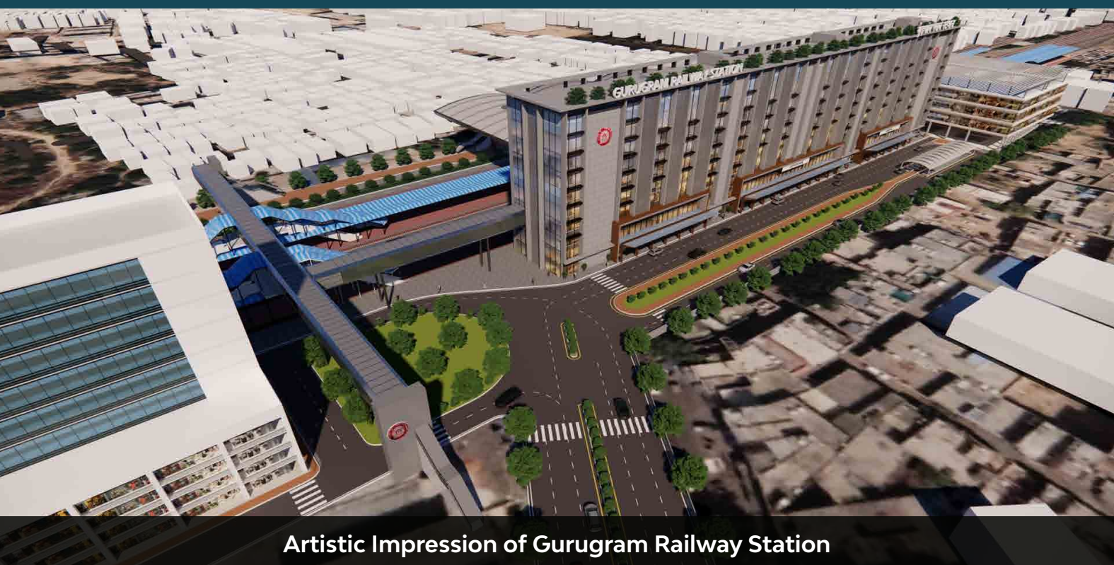
Artistic Impression of Gurugram Railway Station

Grant of Lease for Commercial Development on Railway Land Parcel of approx. 3.5 Acres (14,164.50 Sqm.) in Dharmavaram along the Station Road, Andhra Pradesh for 45 years