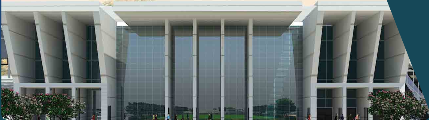
Artistic impression of Chandigarh Railway