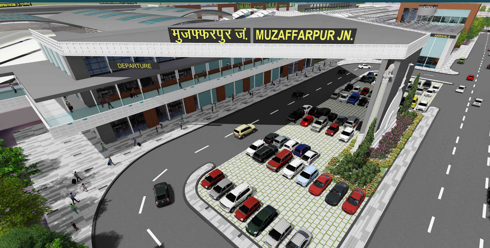
Artistic Impression of Muzaffarpur railway station

Request for proposal through e-tendering mode for providing legal assistance for issues arising out of EPC Contract