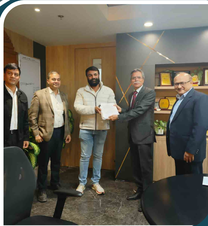
Railway Land Parcel at Strachey Road Colony, Liluah with Developer on 27/12/2023