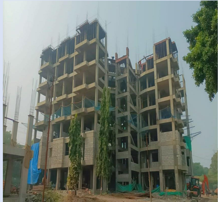
Current View of the Project