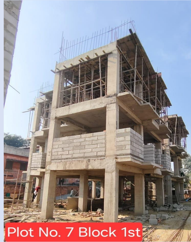
Current View of the Project