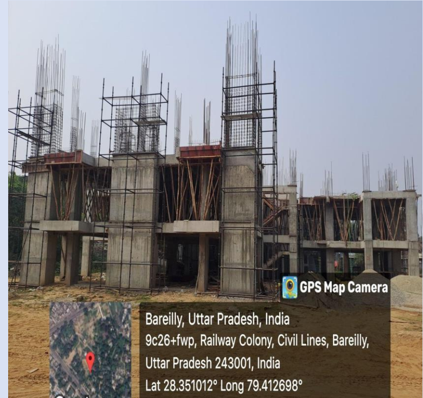
Current view of the project