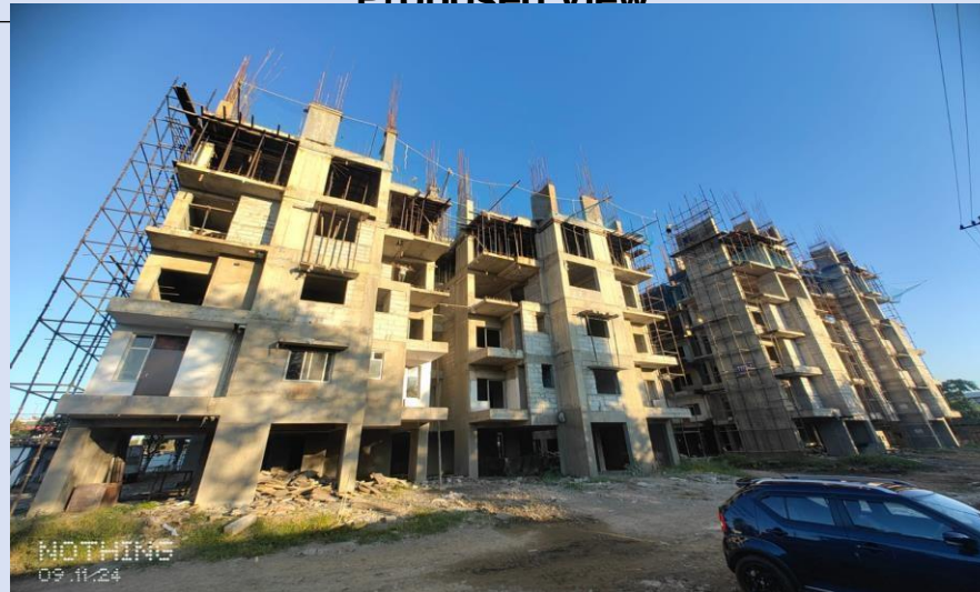
Current View of the project