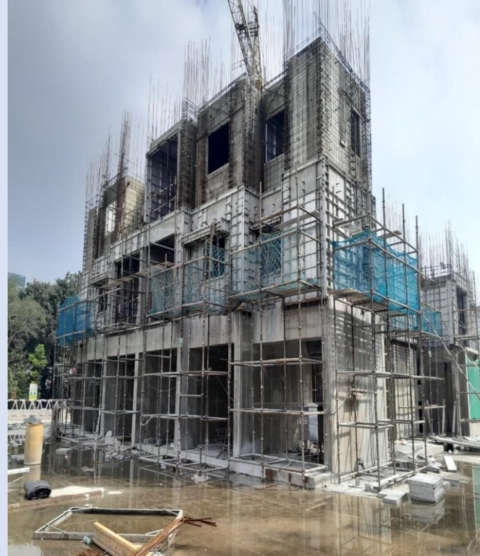
Current View of the Project