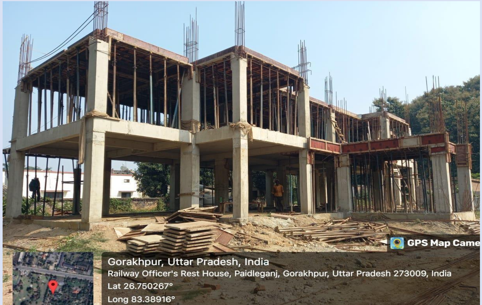
Current View of the Project