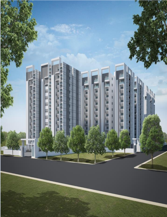
Proposed view of Rifle Range Colony